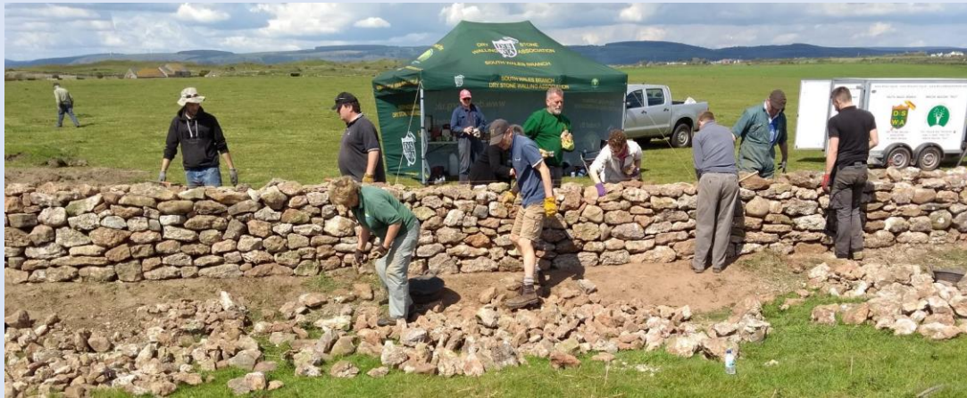
Figure 1 Dry Stone Walling

The Dunes 2 Dunes project formed a collaboration of nature reserve managers, volunteers and landowners to sustainably manage the habitats along Bridgend's coastline. Positive engagement with the golf clubs was a key element, successfully delivering a new partnership with these landowners. The clubs have demonstrated an ongoing commitment to sustainable management practices, with two clubs achieving GEO certification, an international ecolabel for golf facilities.