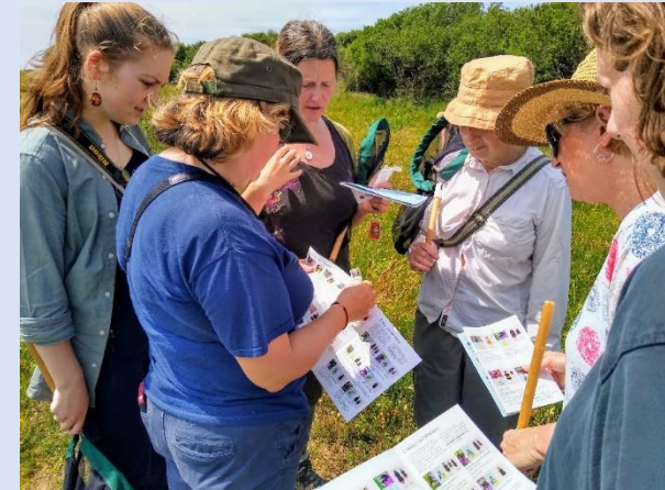
Figure 2 Bee Identification Training

Volunteer training provided opportunities to learn skills such as dry stone walling (See Figure 1), habitat management and species identification (See Figure 2), raising the profile of scarce species such as Shrill Carder Bee. Visitor experience and access have been improved by project activities, whilst dune management and enhancement works are already demonstrating positive outcomes for biodiversity, with records of the critically endangered, and legally protected, Fen Orchid increasing from approximately 400 to over 4000 over the course of the project.