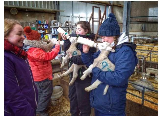
Community Engagement Activities, Dune 2 Dunes

The project included piloting of grazing tracking collars and activities to raise awareness on conservation grazing and to promote responsible behaviour around livestock and use of the countryside. A new web-based resource pack for schools was created, providing lesson plans and activities from Foundation Phase through to Key Stage 5, and can be found at www.bridgendreach.org.uk/digital-shepherd-resources .