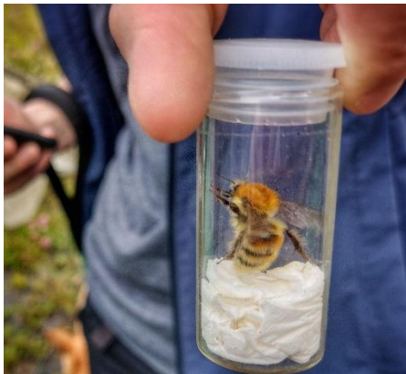
Brown Banded Carder Bee